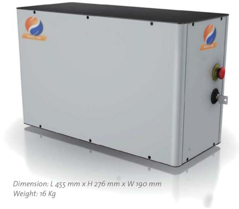
Dimension: L 455 mm x H 276 mm x W 190 mm Weight: 16 Kg